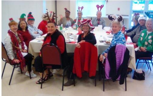
The Pablo Painters enjoyed a holiday lunch in our café.