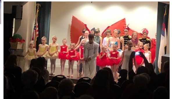
The East Coast Ballet dancers performed pieces from The Nutcracker Ballet.

As Sinatra might sing, "It was a very good year." As we take time to reflect on all that we accomplished this past year, and our hopes for the future, we look forward to sharing our lives with you for another year.