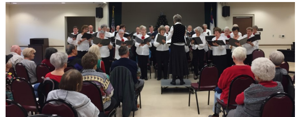
Singers by the Sea officially opened the holiday season at Pablo Towers.