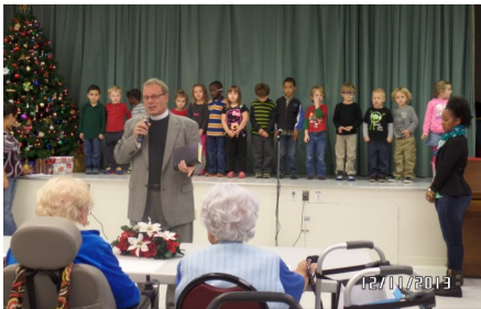
Bethlehem Lutheran Church Preschool Choir Sang for 24th Straight Year at the December Resident Birthday Party