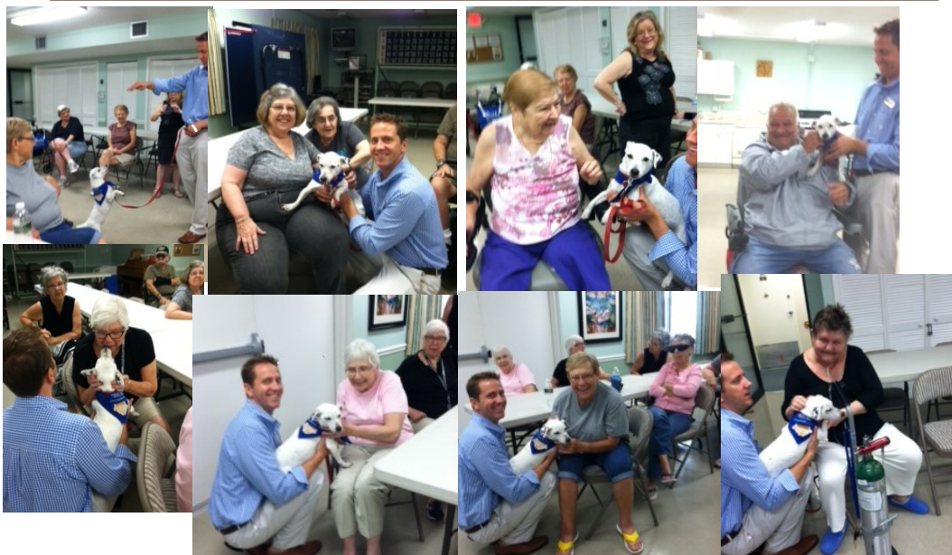
Residents enjoyed meeting and loving on Beau, St. Michael's Home Care Director of Therapy. He loved everyone in return.